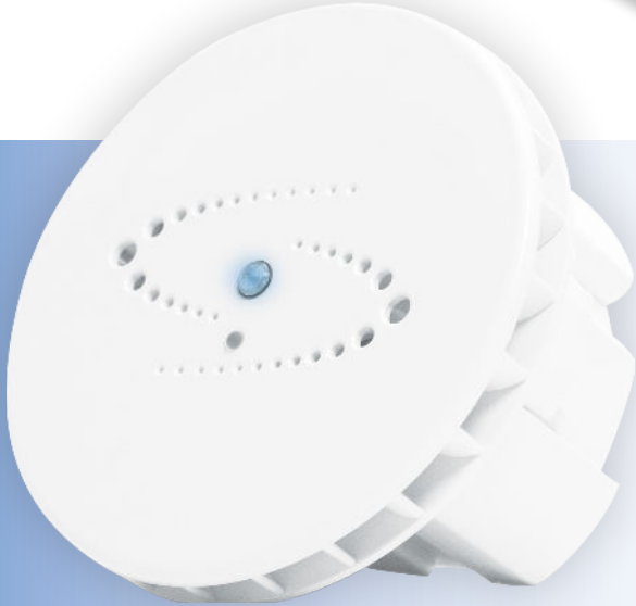
HALO Smart Sensor is Patented.