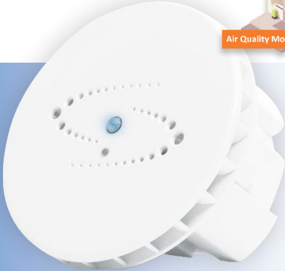
HALO Smart Sensor is Patented.