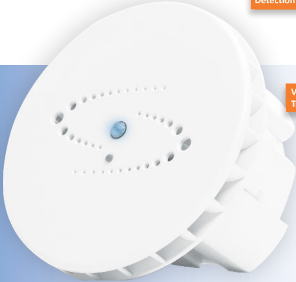
HALO Smart Sensor is Patented.