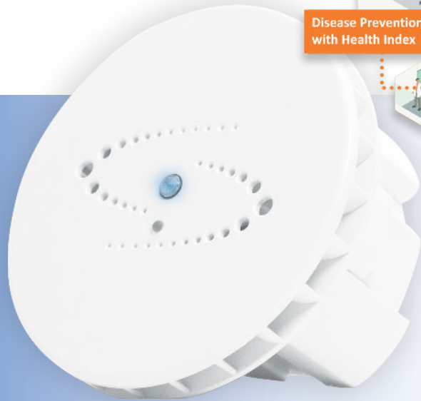
HALO Smart Sensor is Patented.